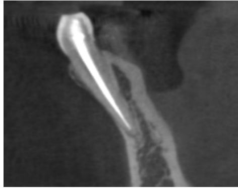
Figure 2. Good RCT treatment.

Of the 504 CBCTs examined in this study, only 31 maxillary and mandibular teeth (20.61%) of root fillings had high technical quality. Different surveys have demonstrated that general practitioners, even the recently qualified, do not follow guidelines taught during their basic education (Helminen et al., Hill and Rubel) [10-13] . Undoubtedly, this needs to be improved. However, it is already known from an investigation of the frequency and distribution of root-filled teeth and apical periodontitis in a Greek population that the prevalence of apical periodontitis associated with the root-filled teeth was 60% (Georgopoulou et al.). It is well established that the presence of apical periodontitis in root-filled teeth is often associated with inadequate root fillings.